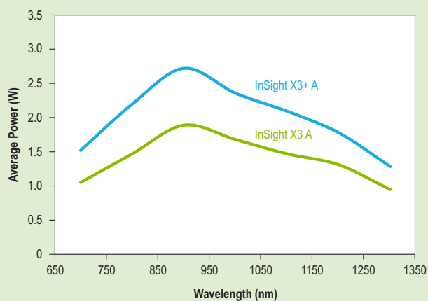
Typical InSight Tuning Curves 1

1. Typically measured performance; not a guaranteed or warranted specification.