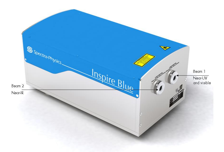
Figure III. 1.- The Inspire Blue output apertures

The Inspire Blue partially converts the near-IR Ti:Sapphire laser spectrum, tunable between 690 and 1100 nm, into the near-UV and visible, with wavelengths between 345 and 550 nm. The converted laser beam is emitted by one of the two output apertures, as illustrated in Figure III.1. Additionally, the depleted near-IR pump, with wavelengths between 690 and 1100 nm, is simultaneously emitted by the second output aperture.