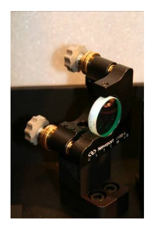
Figure V.1.- Illustration of mirror mounts

Mirrors M1, M2 for the lens-based version and mirrors M1, M2, M3 and M4 for the mirror-based version are mounted on adjustable mounts as illustrated in Figure V.1, which allow tilting and alignment of the input beam.