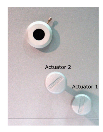
Figure IV.1. Inspire Blue Control program, "Configuration" mode.