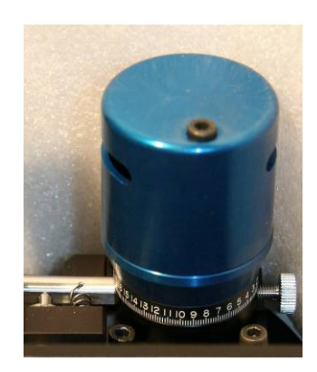
Figure V.2.- Illustration of crystal box

The nonlinear crystal C1 is positioned on a rotation stage which facilitates tuning and power optimization, by varying the angle of incidence of the input light onto the crystal.